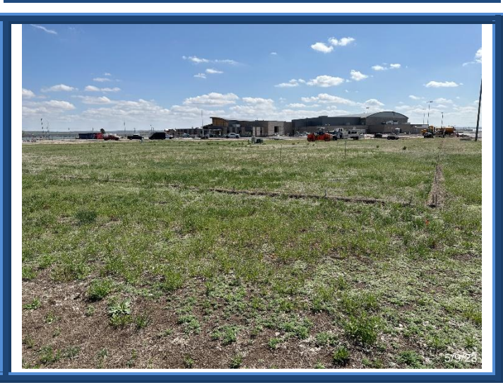
Cottonwood & Chestnut St, Julesburg